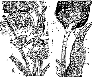
Daffodil 2 layers, bottom layer 4 inches deep