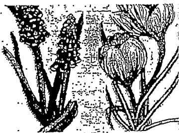
Grape hyacinth 2 inches deep, split bulbs in two clumps