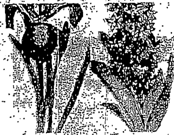
Dutch Iris 2 layers, bottom layer 2 inches deep, clump in middle