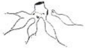
Dividing a dahlia clump

Around November 1 st , cut dahlias down and lift the roots carefully with a spade by digging around the entire plant about one foot from the stalk. Use care to prevent "broken necks" when lifting clumps out of the ground. Wash clumps, trim stalks a few inches above root level, and divide. Remove tubers from clump using a knife or sharp pair of clippers. Make sure each tuber has an eye or it will not grow the next year. (See illustration) Most growers store tubers in a medium such as vermiculite, potting soil or sawdust in order to prevent shriveling. Put tubers in a plastic bag with medium and place bags in a storage container. Place containers in a storage area that is cool but always above freezing. Check tubers twice during the winter and discard any that show rot.