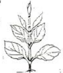
Pinching the top

Planting: Dahlias should be planted when the soil warms up, usually late April to mid-May in the Pacific Northwest. Dahlias vary in height so it is best to arrange your garden with taller varieties toward the back of your beds. As a general rule allow 2 to 3 feet between plants. When planting the tubers, place a stake in the ground and dig a hole about 6" deep on each side of the stake. Place the tuber flat with the eye upward near the stake and cover loosely with soil. (See illustration)